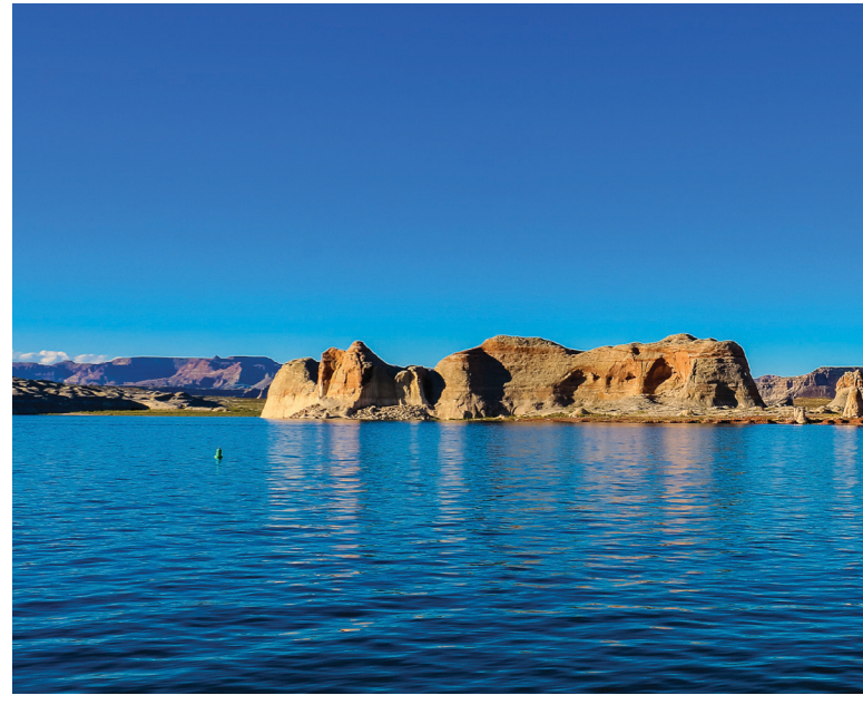
Enjoy a private dinner cruise aboard a yacht on Lake Powell, viewing the sculpted landscapes of this manmade lake.

Home to the biggest canyon on earth at 277 miles long, 10 miles wide, and a mile deep, Grand Canyon National Park contains some of the oldest exposed rock on earth, stories that transcend time and secrets yet to be discovered.